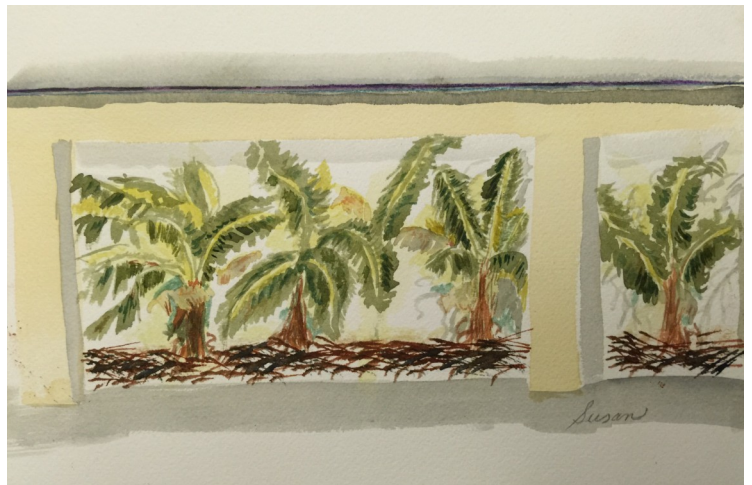
Painting by Susan, outside Hobart Hall screened porch (where many HEP classes and workshops are held)