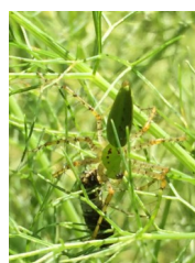
Lynx Spider eating black swallowtail caterpillar

Further, we finished the corner mini-botanical gardens in the theme of the four Medicine Wheel quadrants—Fire, Water, Earth and Air. Being among the gardens and the Holton Eco-Preserve is such an up-lifting greenspace experience. This season we are offering an incentive to existing renters until November 30: If you recommend someone to become a new Holton Eco-Preserve member and rent a new garden, both you and the new renter will each receive a $10 rebate.