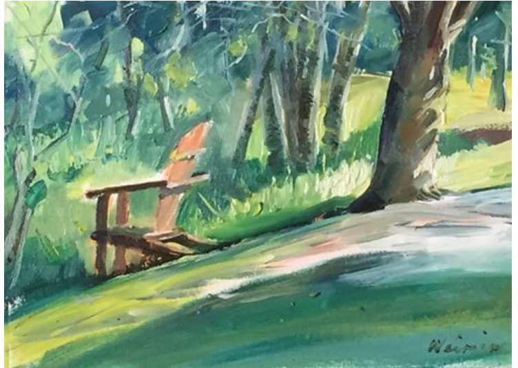
Painting by Mo, reflection area around HEP pond