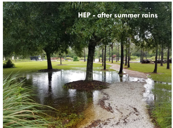
HEP - after summer rains